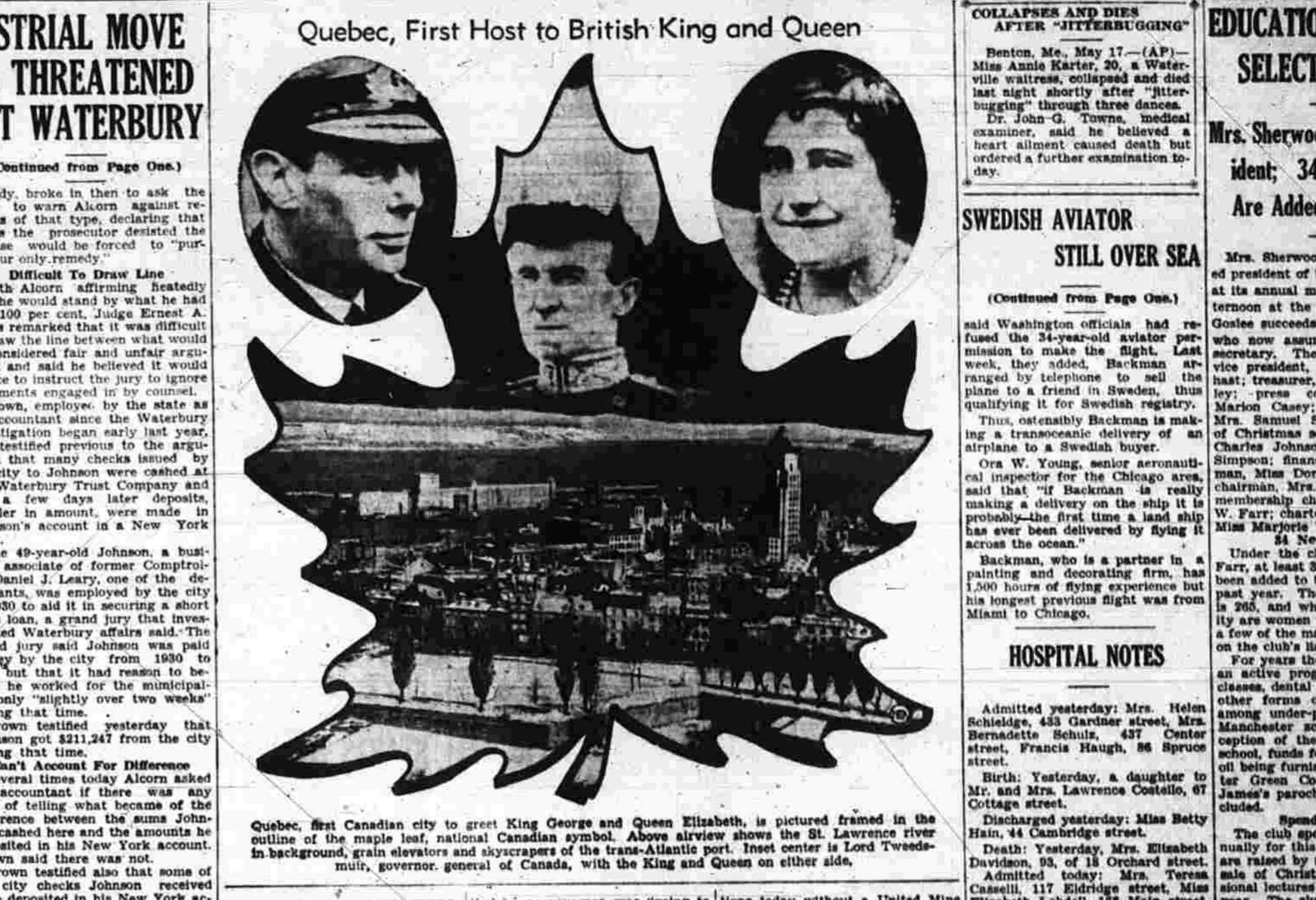
Quebec, First Host to British King and Queen